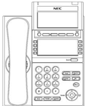
DESI Less 8 Button